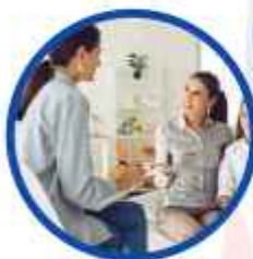
Social Welfare Administration