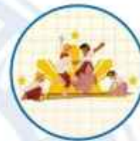
DON BOSCO CLUB OF PERFORMING ARTS