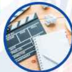
Script and Screenplay Writing