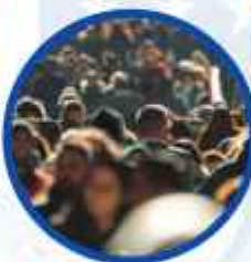
Human Behavior and Social Environment