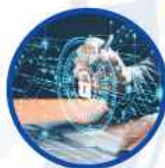
Networking and Cybersecurity