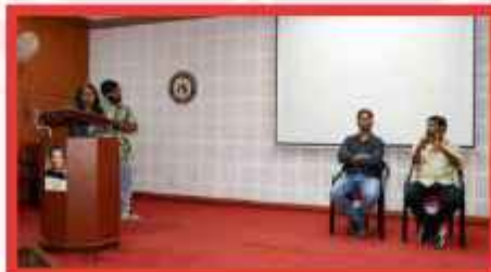
FILM TEAM INTERACTION