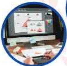
Graphic and Visual Design