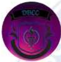
ELECTORAL LITERACY CLUB