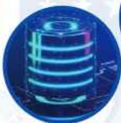
Database Management Systems