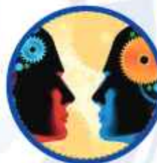
Counseling and Psychotherapy