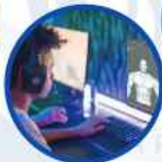
3D Modelling and animation